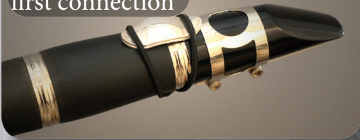
Clarinet first connection