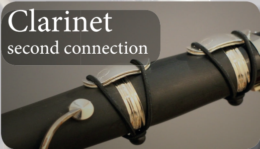
Clarinet second connection